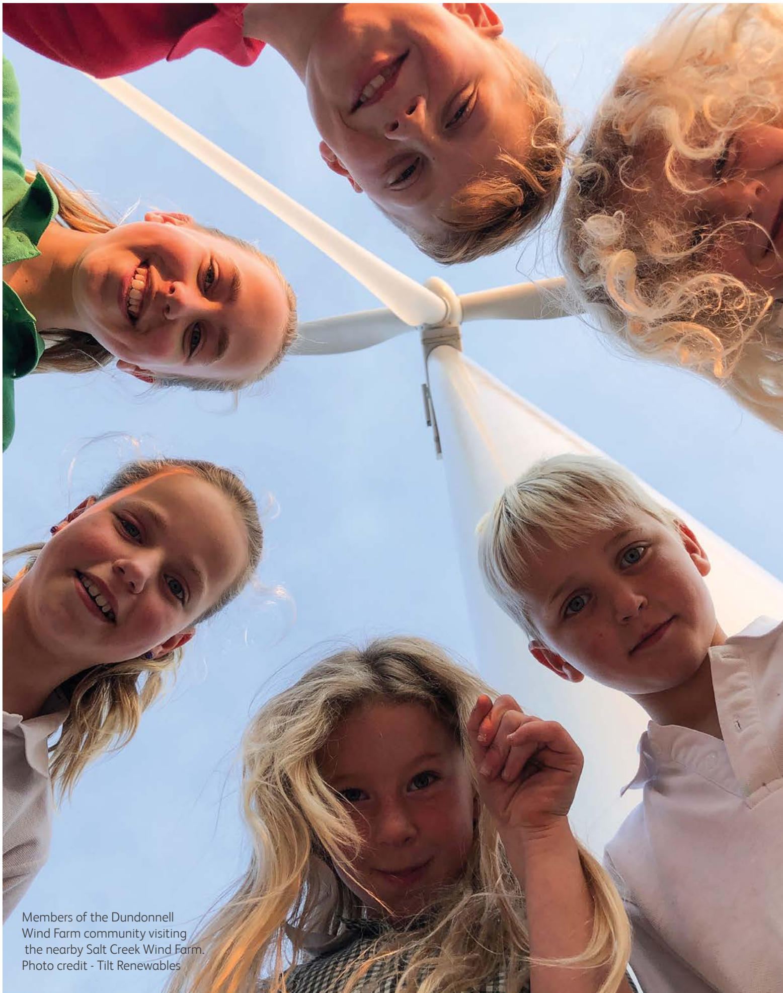
Members of the Dundonnell Wind Farm community visiting the nearby Salt Creek Wind Farm.