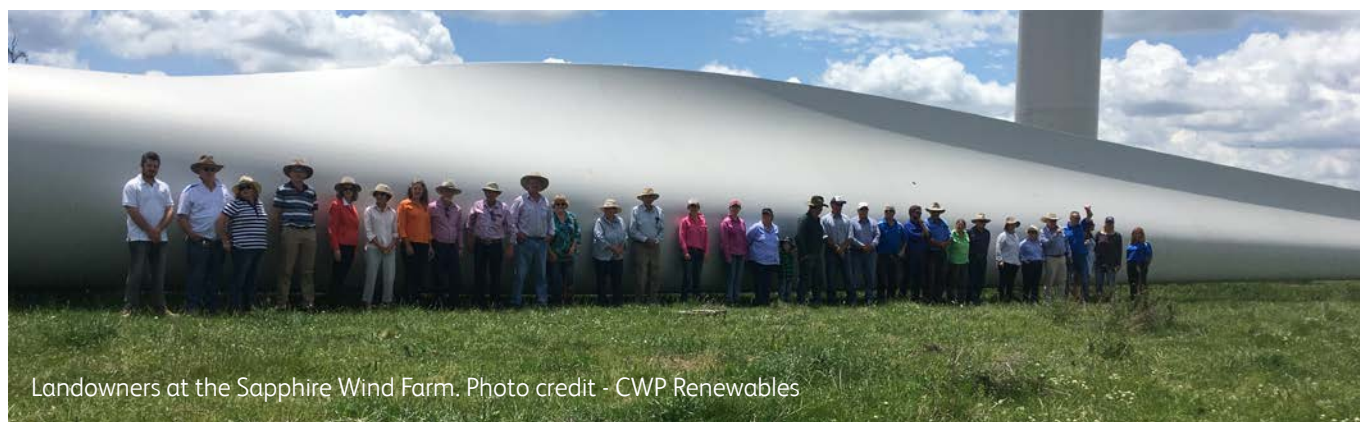
Landowners at the Sapphire Wind Farm.