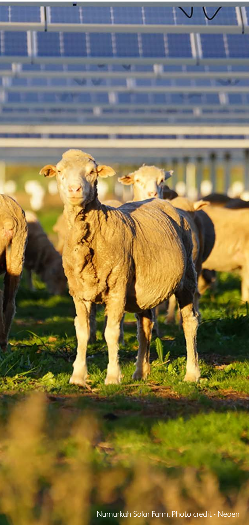
Numurkah Solar Farm.