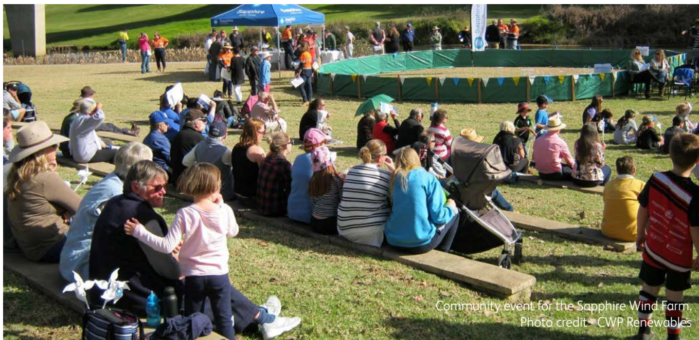
Community event for the Sapphire Wind Farm.