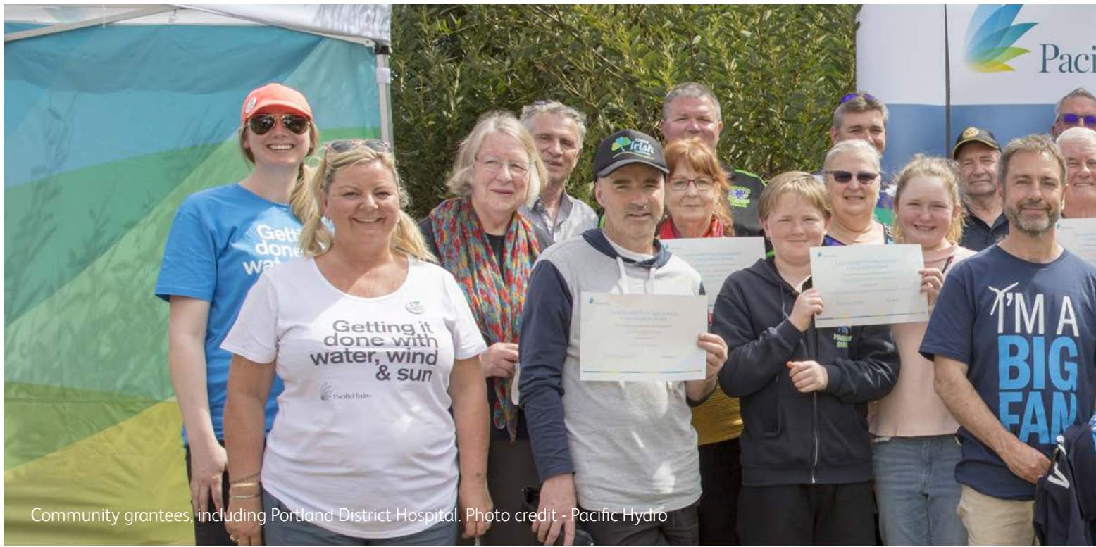
Community grantees, including Portland-District Hospital.