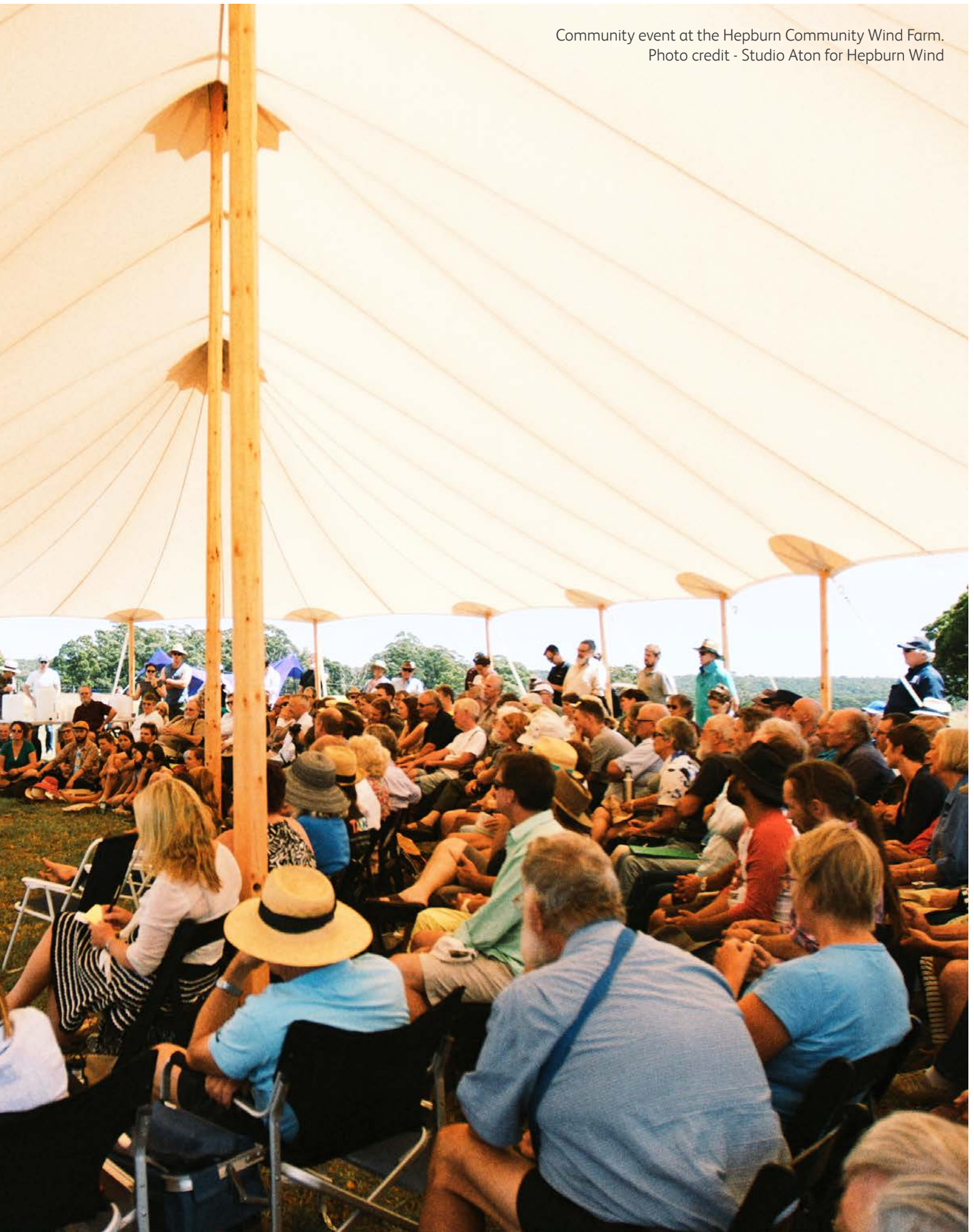
Community event at the Hepburn Community Wind Farm.