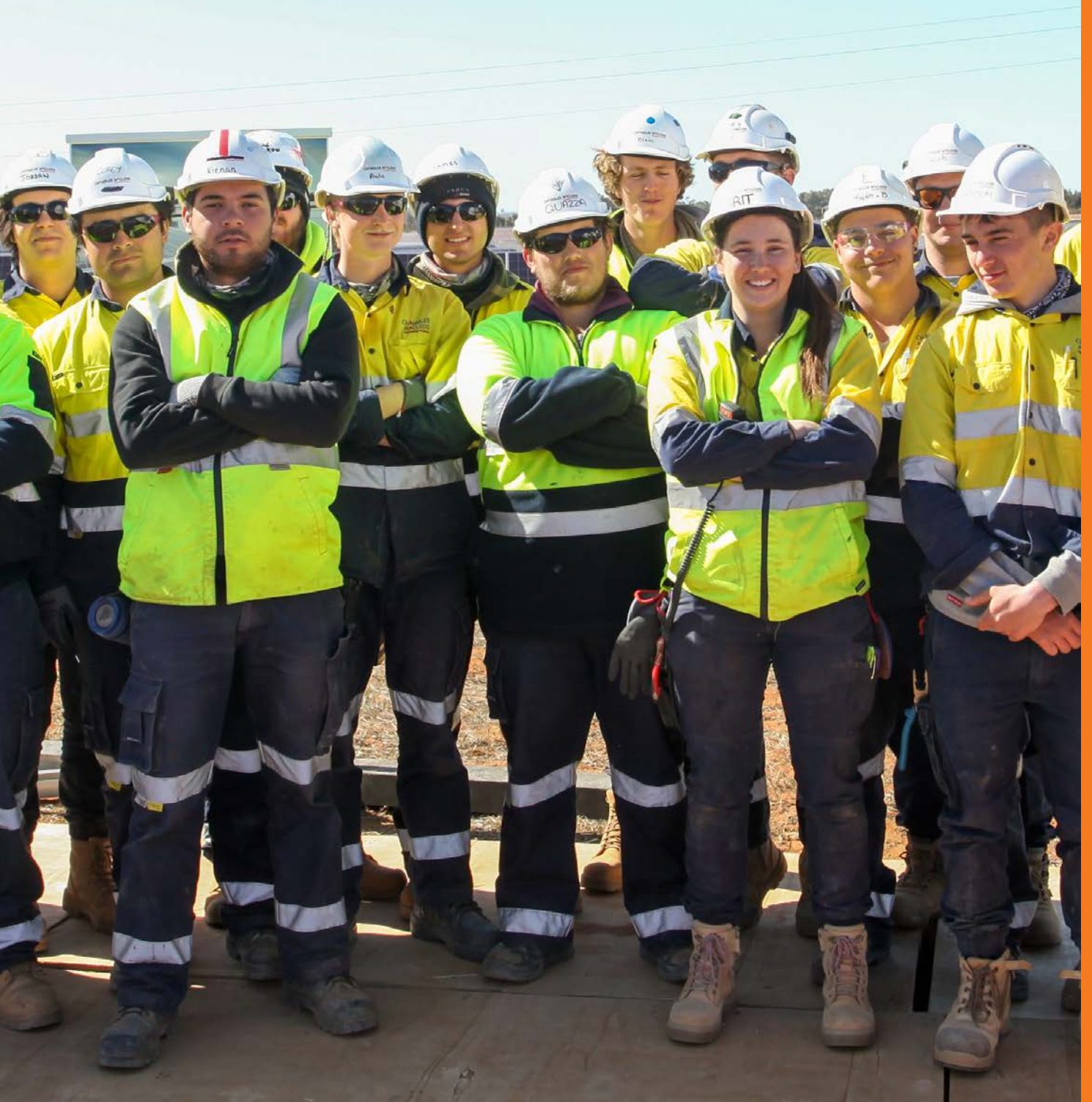
Apprentices at the Karadoc Solar Farm.