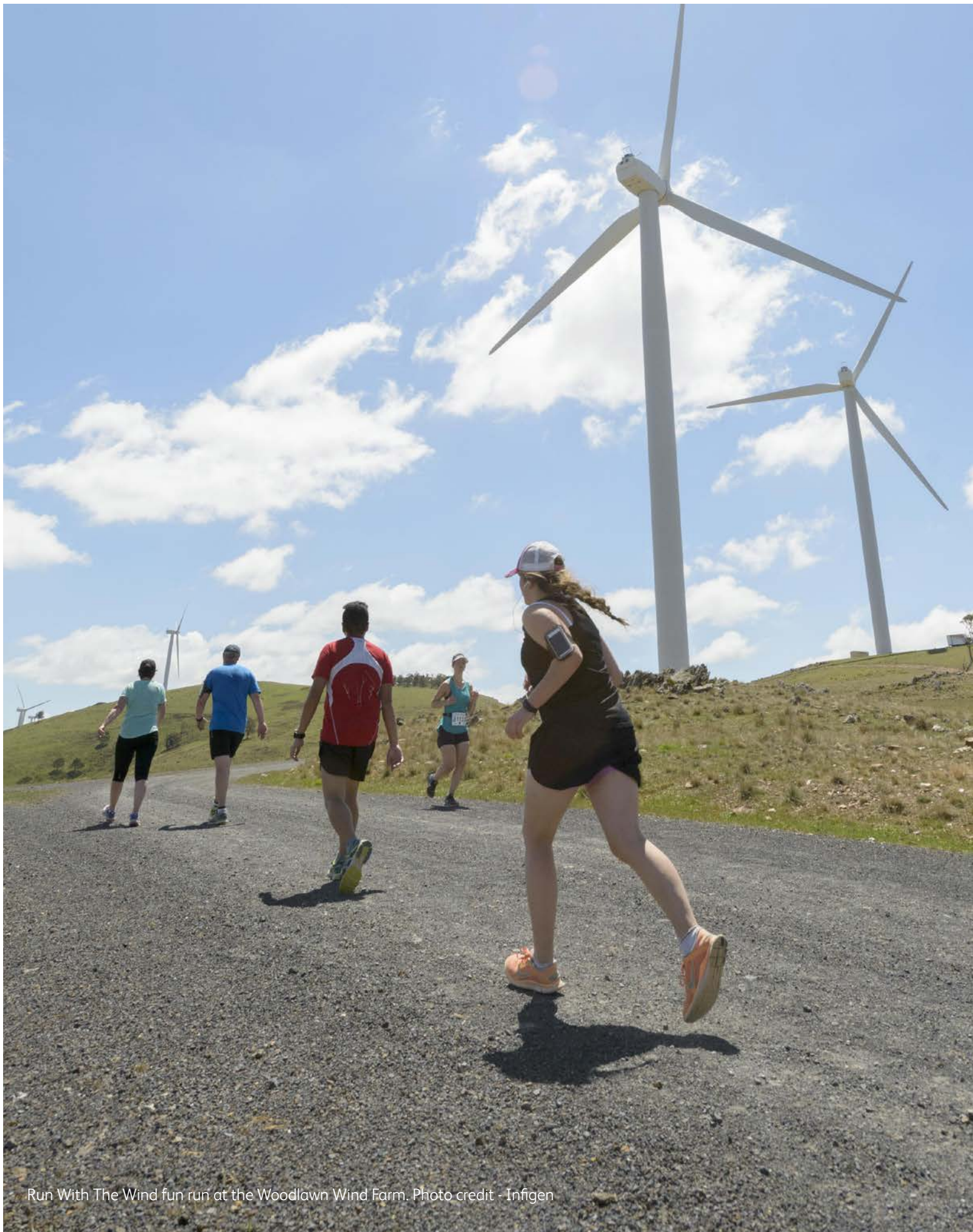
Run With The Wind fun run at the Woodlawn Wind Farm.