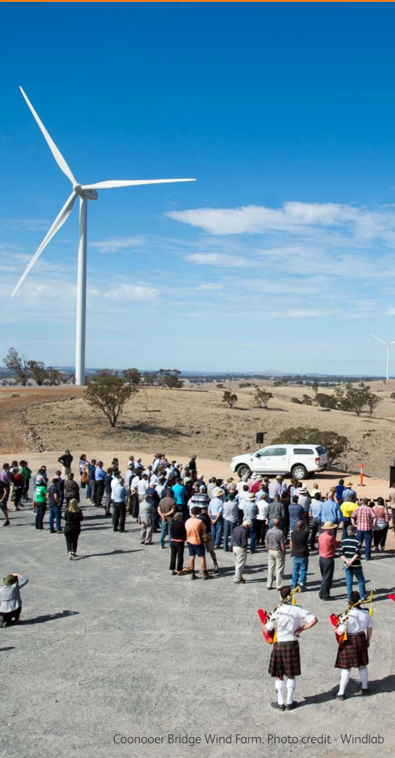
Coonooer Bridge Wind Farm.

Windlab has calculated that the risks of poor relationships with the community pose significant and calculable risks for project development. For example, responding to objections, failure to secure planning approval from council, appeals processes, reputational damage, failure to secure finance or an off-take agreement, loss of landholder support and damage to team morale are all risks associated with not achieving a social licence to operate. Windlab calculated that these risks could cost the project in excess of $5 per MWh and 36 months of time. As such, the company sought to implement quality community engagement and benefit sharing strategies that cost less and take less time than these possible risks.