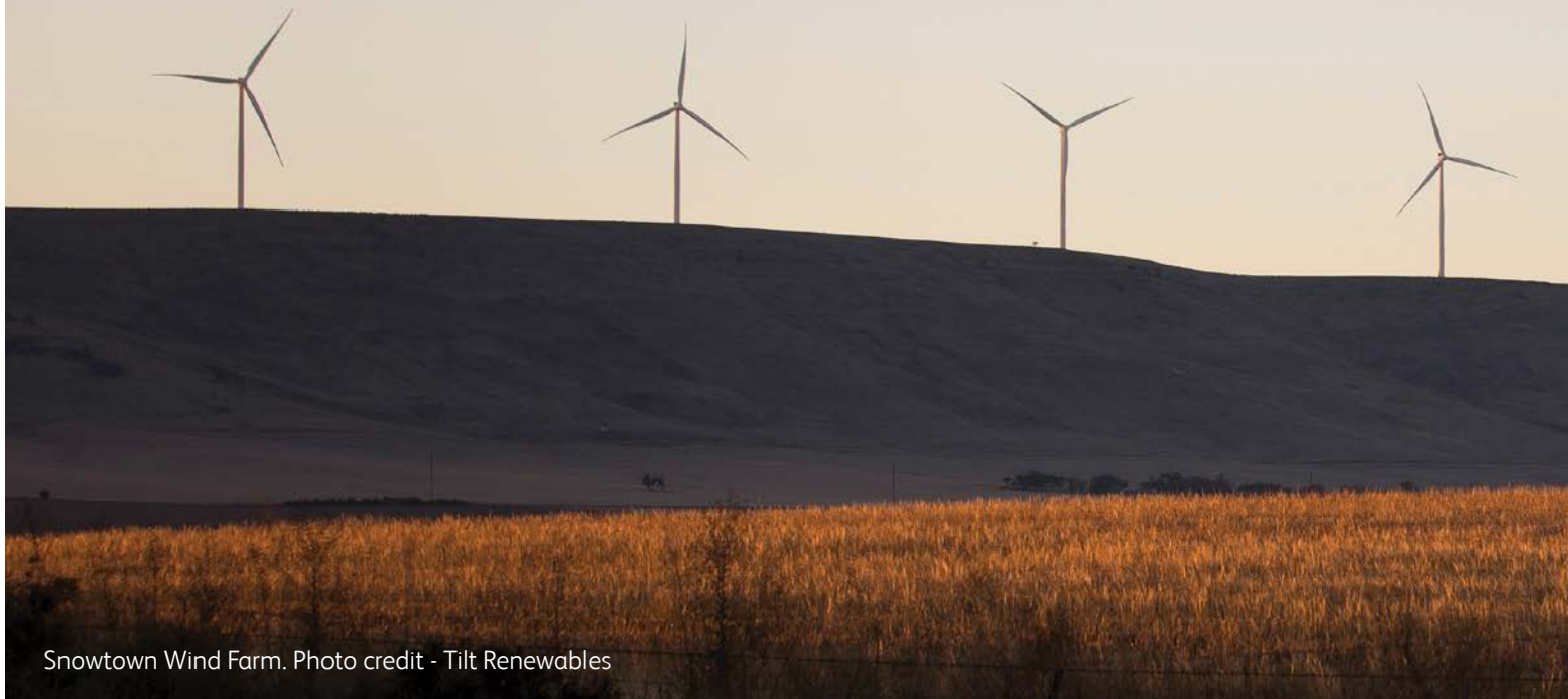
Snowtown Wind Farm.