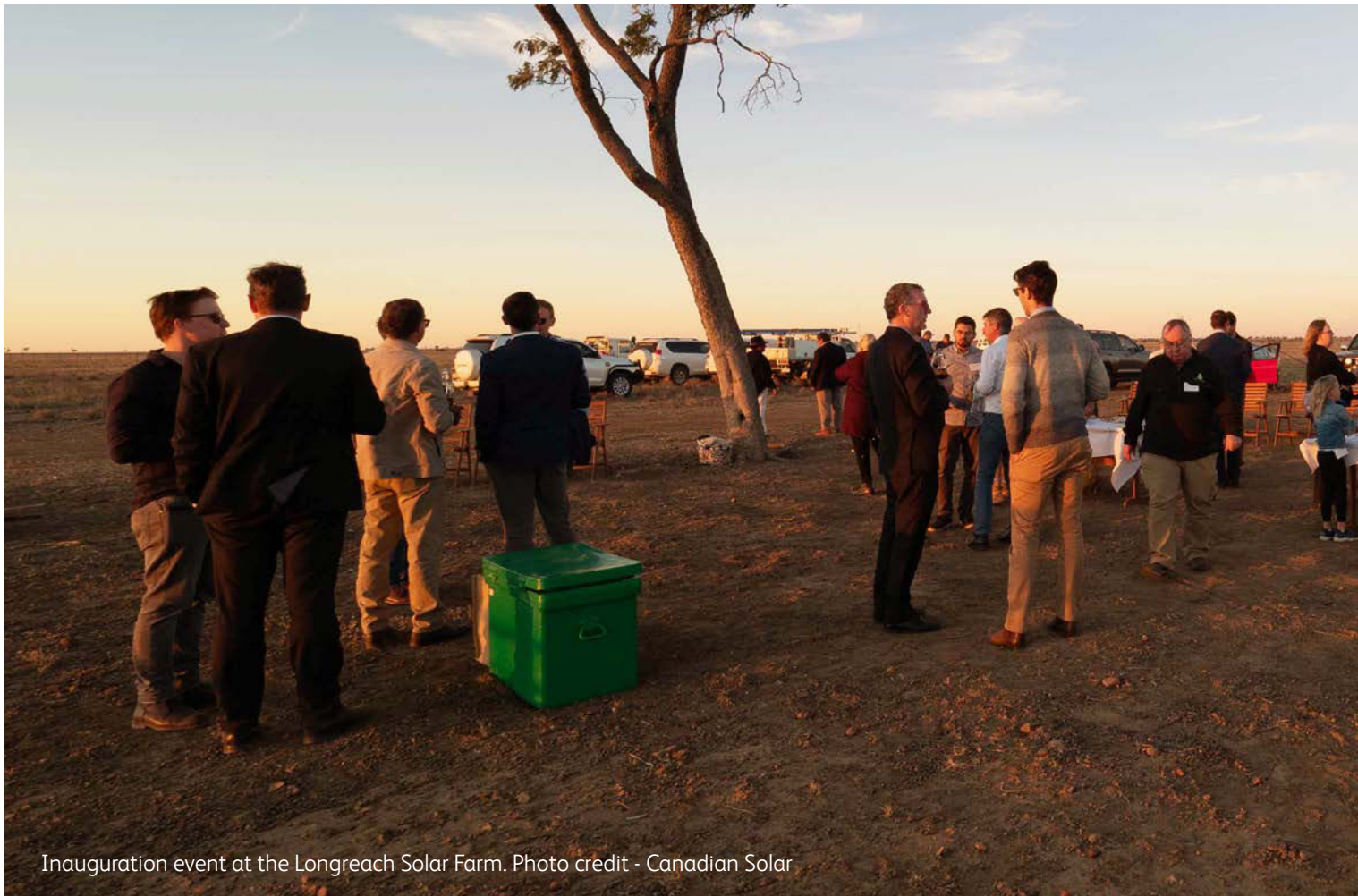
Inauguration event at the Longreach Solar Farm.

In terms of neighbour benefit sharing, we see it as a tool to help alleviate some of the divisions that can happen between those hosting turbines on their land and those that aren't hosting turbines but are still close to the project area. Wind turbines are getting bigger and bigger, which allows more efficient projects and lower cost of energy but means there is sometimes not much difference in effect on a landowner who hosts a turbine on their land versus a landowner who has one a few hundred metres away from their fence. In our experience, tailored neighbour benefit sharing schemes can have a positive impact in this space.”