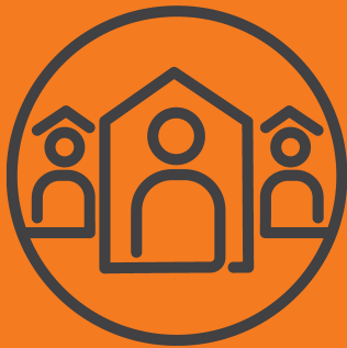
Neighbourhood benefit programs

There are many possible forms that benefit sharing can take throughout a project's development. The following have emerged as the main types of benefit sharing being deployed in the Australian context: