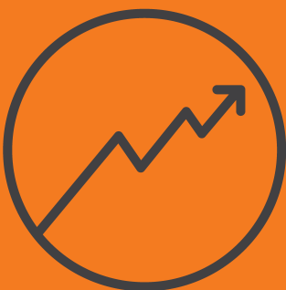
Innovative financing and co-ownership