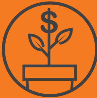
Sponsorship, grant and legacy initiatives