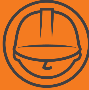
Local jobs, training and procurement