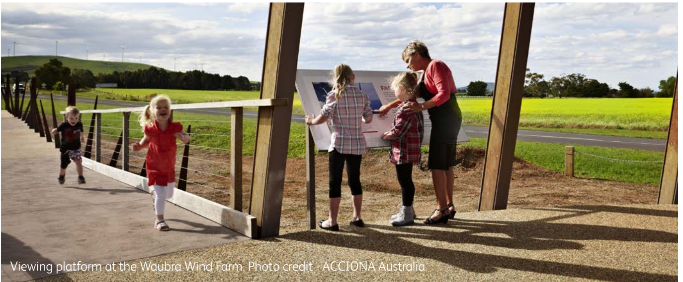
Viewing platform at the Waubra Wind Farm.

Several factors are driving the increased interest in benefit sharing. Firstly, investors and financiers are seeking to ensure that their investments enjoy a strong social licence to operate in the community. It is increasingly common for financiers and all levels of government to require that renewable energy developments actively show they have a social licence to operate in the local community in order to gain long-term contracts, access support schemes or secure finance. Incentivising the renewable energy industry to value benefit sharing has multiple benefits. It encourages a fairer allocation of benefits among hosts, neighbours and the local community and helps to position communities to maximise the benefits of renewable energy developments. Benefit sharing is thus recognised as a strategic means to enhance social licence and maintain it over time.