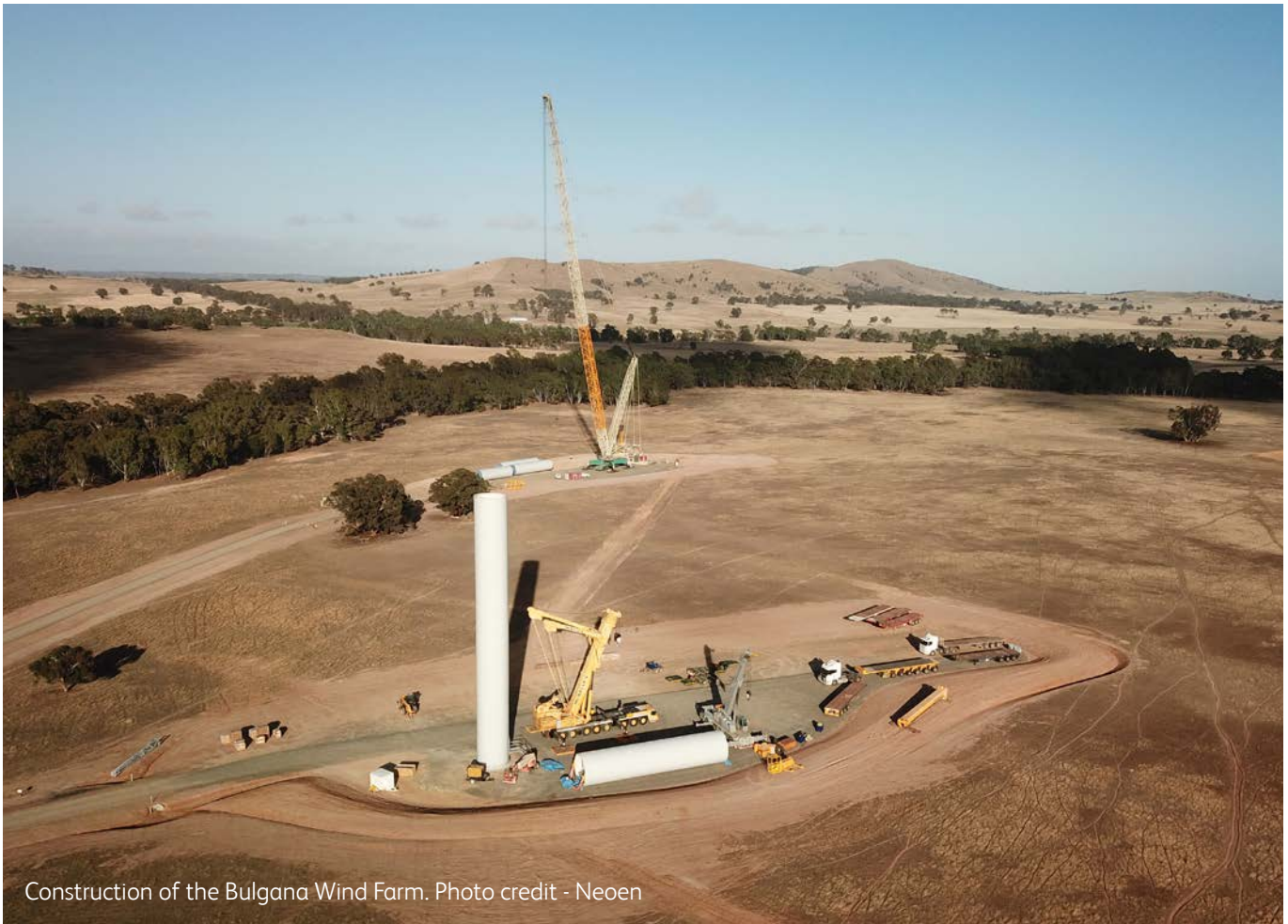
Construction of the Bulgana Wind Farm.

Other innovative products include the development of tourism opportunities. Energy tourism is a growing sector in Australia and is well established in certain regions of Europe and Asia. Individuals and groups, such as schools, often want to visit large-scale renewable energy projects to see how technologies operate and hear the story of how they originated, the lessons learnt along the way and how they contribute to the local community. Viewing platforms, interactive storyboards, live generation data, events and project tours are ways to develop these opportunities. They also assist to educate the broader community, promote the benefits of renewable energy and demystify the technology.